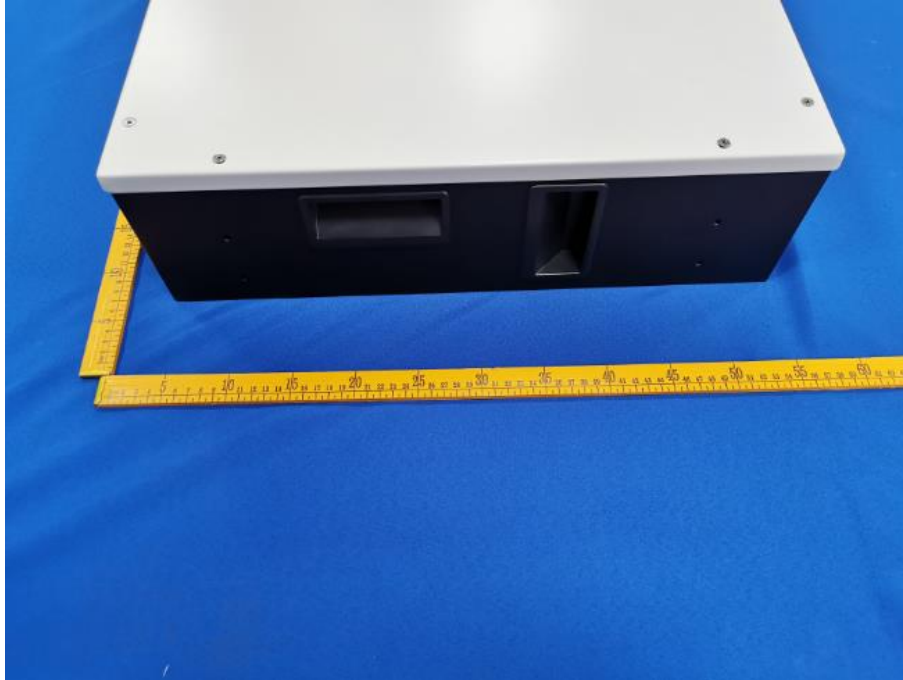
样品图片 (Sample photograph) -4