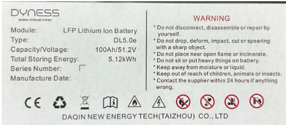
样品图片 (Sample photograph) -8