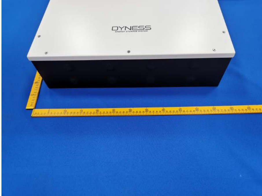
样品图片 (Sample photograph) -6