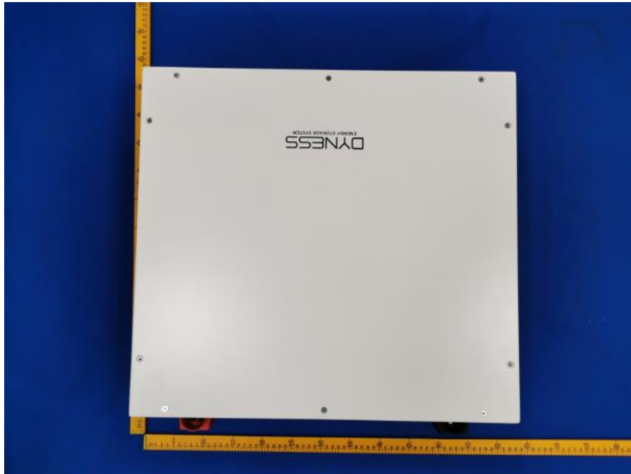
样品图片 (Sample photograph) -2